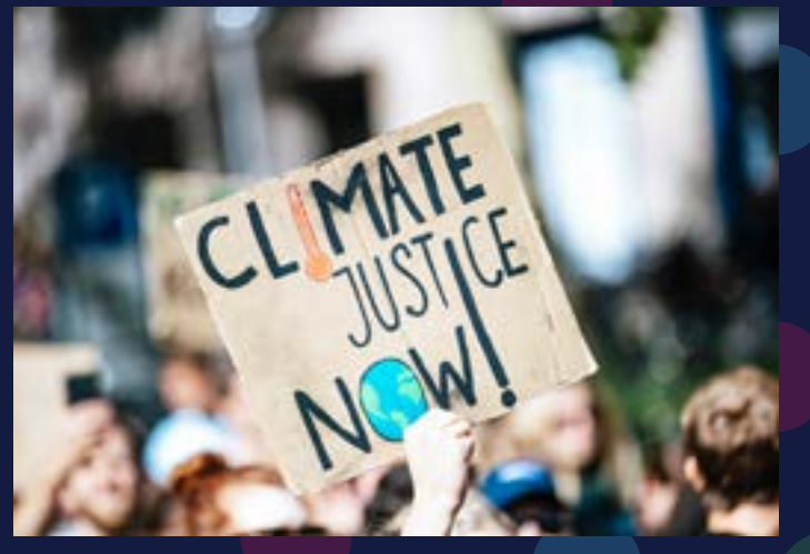
By Markus Spiske